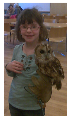
MacGregor the tawny owl.

"Now you are the body of Christ, and each one of you is a part of it."